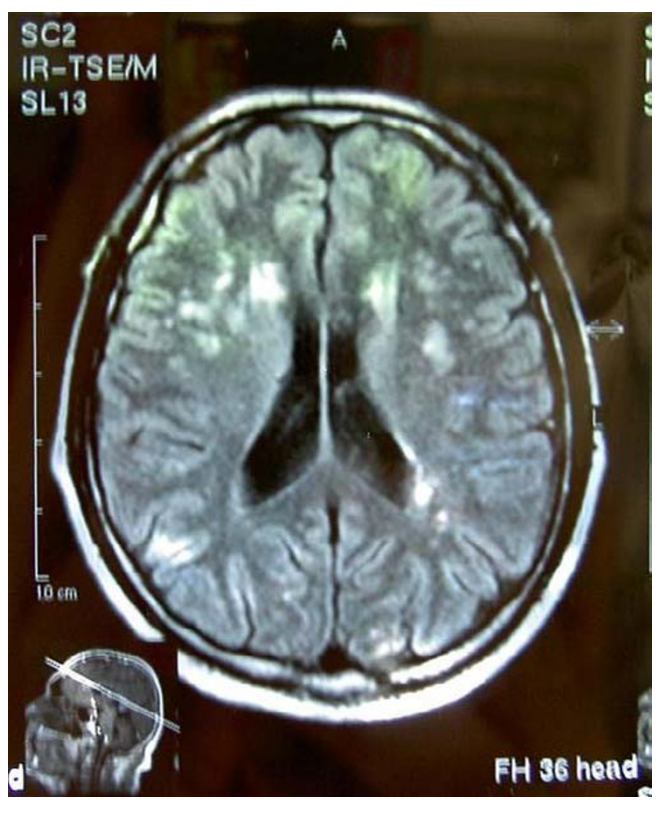
Figure I Brain MRI, T2 sequence: multiple cortical and subcortical infracts in a vascular dementia patient

Table 2: I-way MANCOVA with age and MRI findings as covariates for the comparison between the three clinical groups defined by the severity of dementia (no dementia, mild, severe) concerning their psychophysiological assessement. After bonferonni correction: p = 0.003