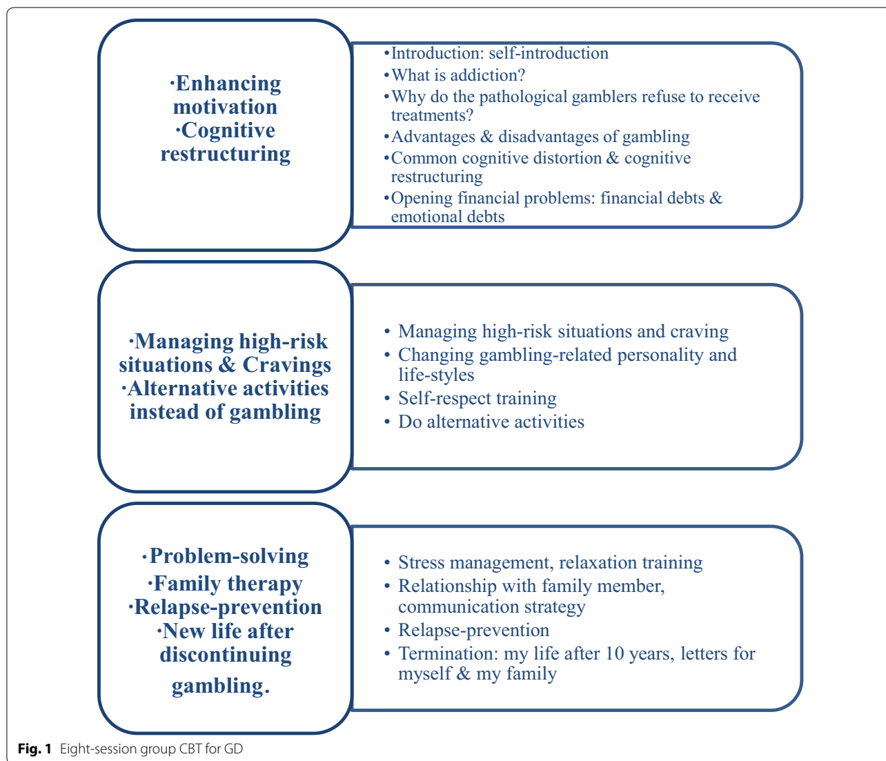
Fig. 1 Eight-session group CBT for GD